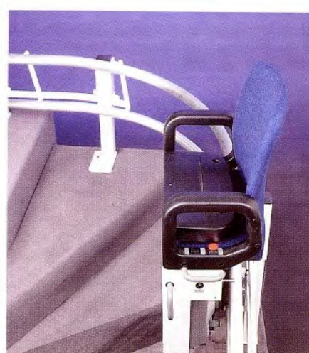
When not required the unit can be folded