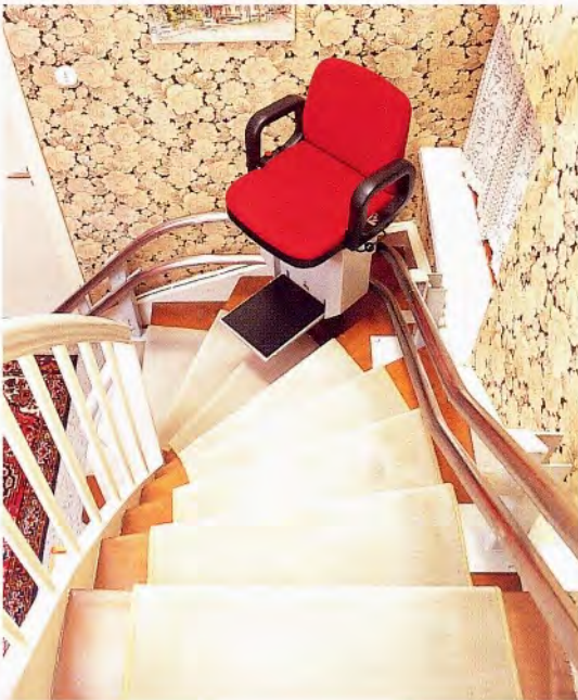
The HIRO 180 mounted on a closed wooden staircase