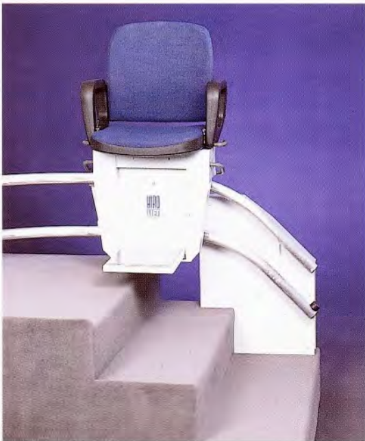
The folding track (Extras) is used for situations where a door is present and may not be blocked. In the neutral position, the track ends flush with the first step. For the downward ride, the track is lowered, complete with passenger for easy access. For the upwards trip, the track is folded back automatically into its normal position, thus leaving the corridor clear.