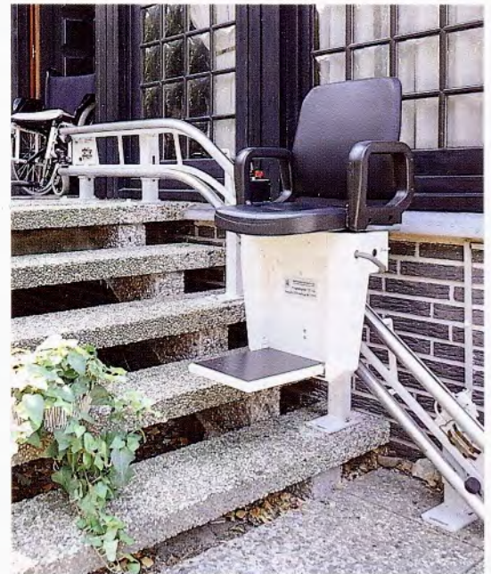
The HIRO 180 External All our chairlifts can be installed outside. The corrosion protection is dependent on the model/type, material is either tensile steel or has been zinc bathed. The electrical system is protected against moisture.