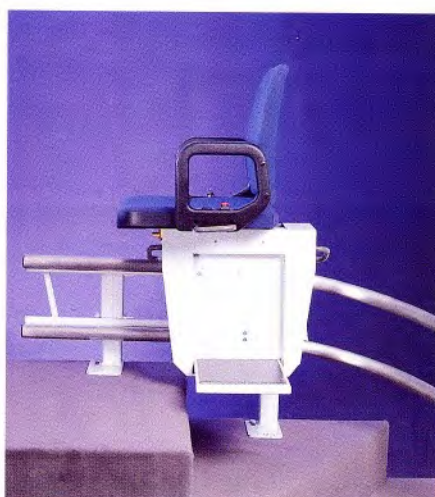
The rotation chair