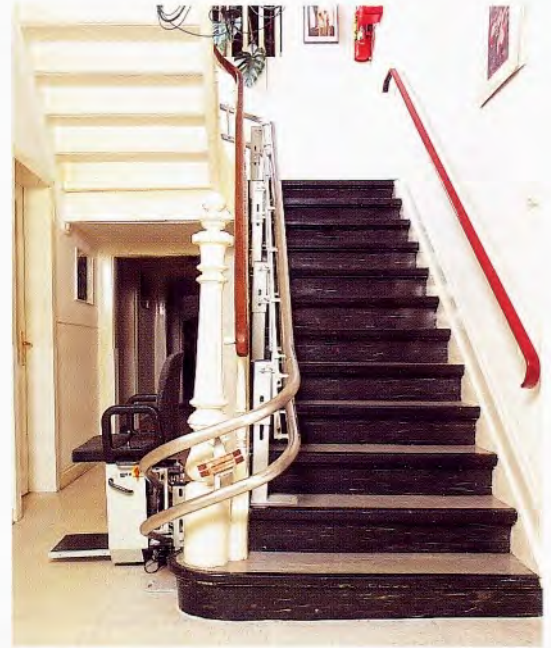
The HIRO 160 mounted on wooden staircase with a PVC floor.