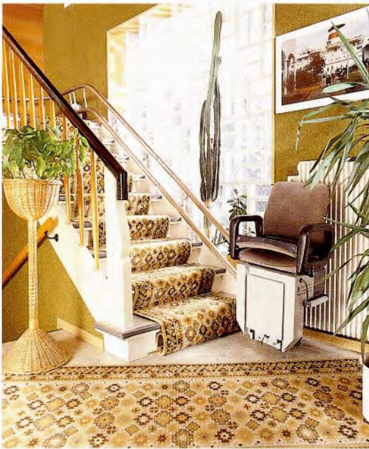
The HIRO 180 mounted on a wooden open staircase.